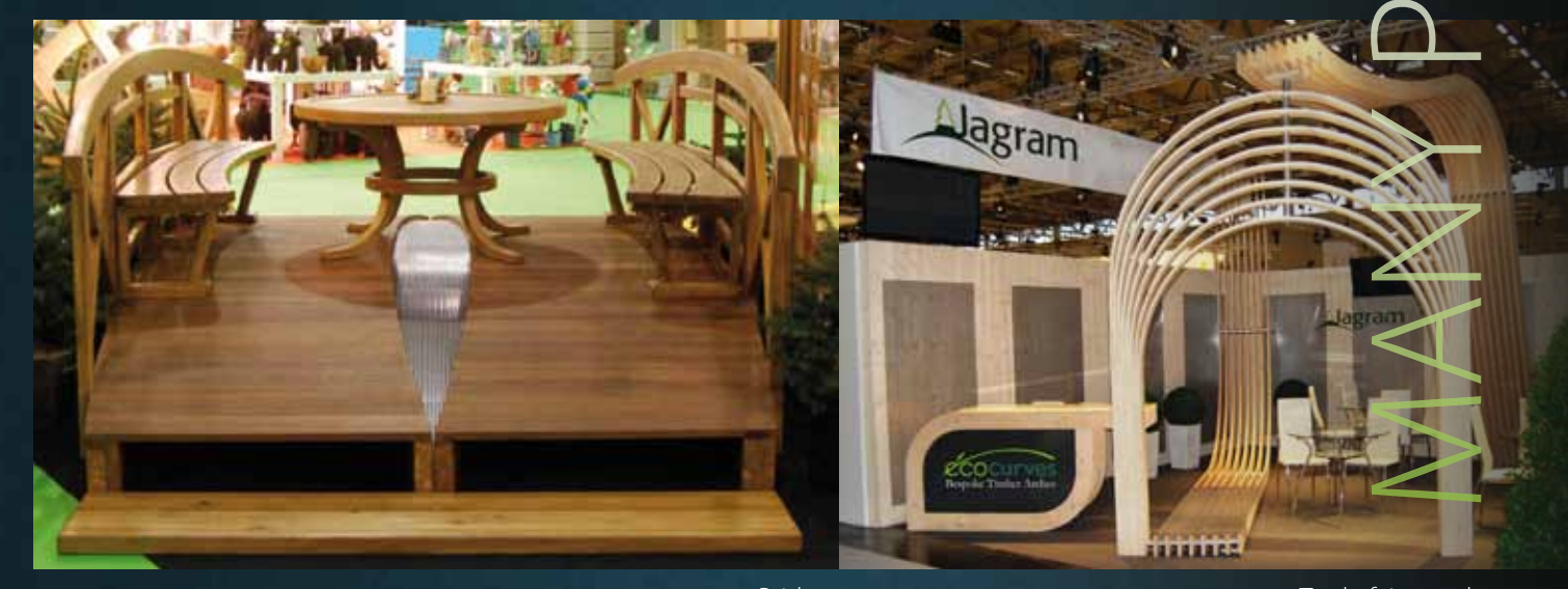
Bridges Trade fair stands