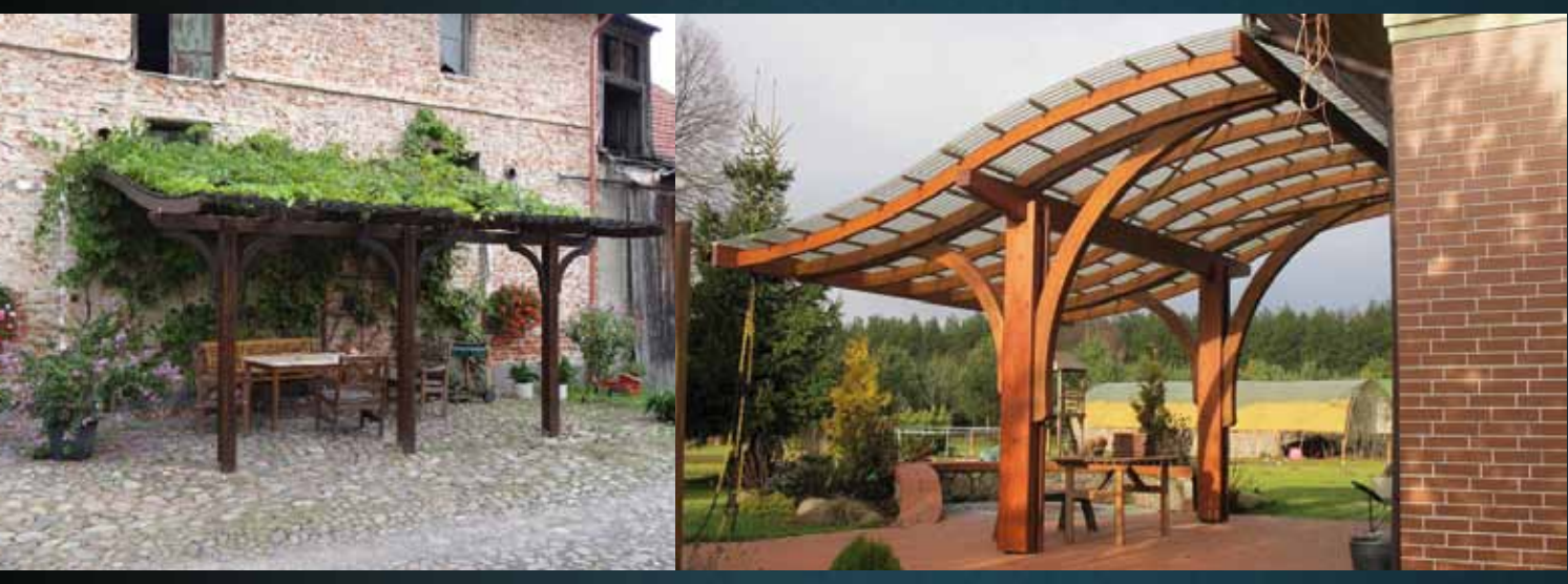
Residential leisure spaces